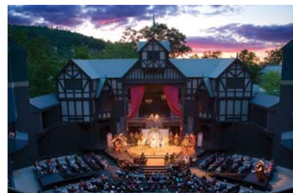
Outdoor Elizabethan Theatre